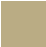
SAMAR BEIGE B-2520