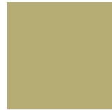
ORIENT GOLD B-2560